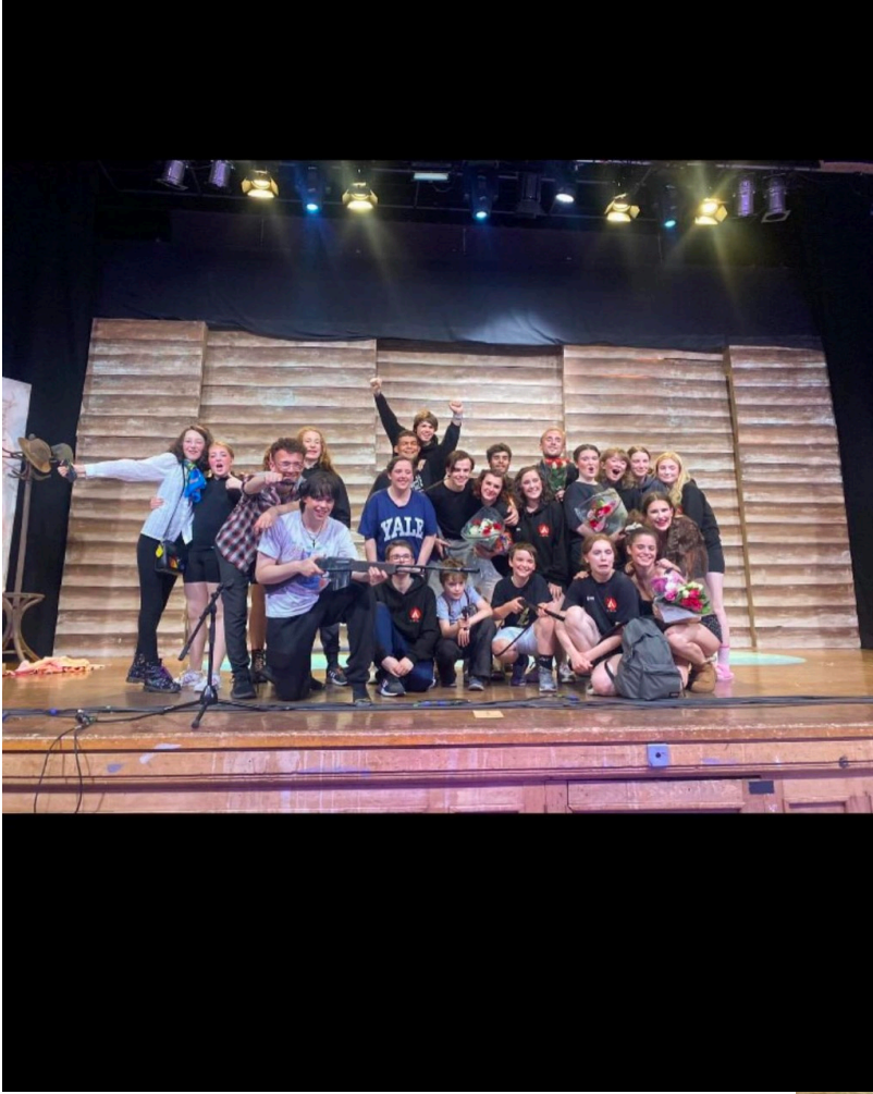
That's a Wrap!