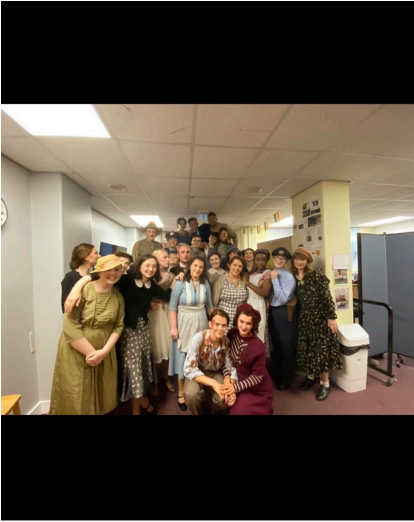
The cast of 2022