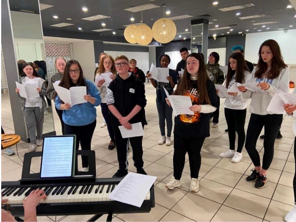
Auditions at Ocean Terminal

"To few it'll be grief; To the Laws a relief, But it's death for Bonnie & Clyde"