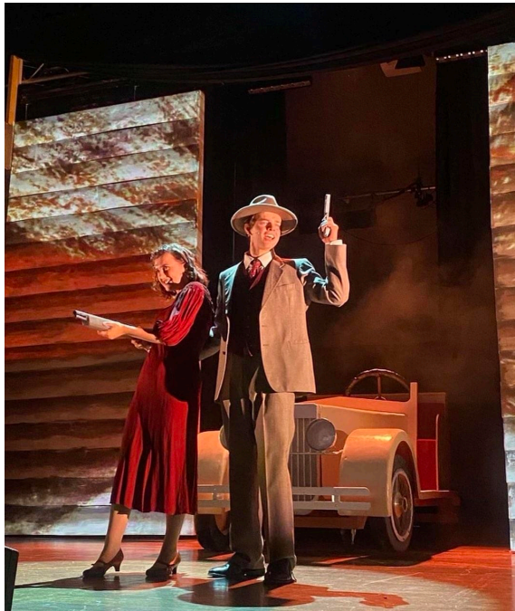
Bonnie & Clyde