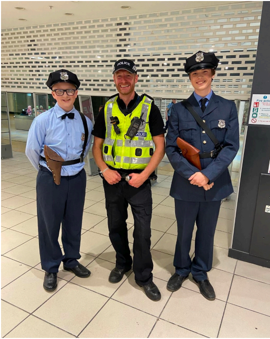
A visit from 'the Laws'